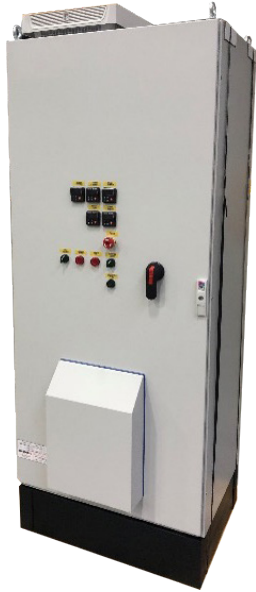
Industry Standard Single Door Panel

Control compartments and branch protection thru door