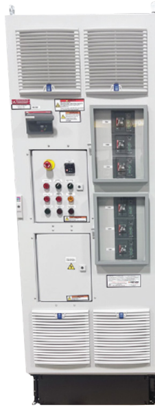
WATCONNECT L / XL High Reliability and Uptime

Enables heat dissipation and faster cooldown