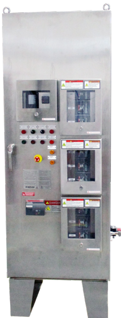
Large, hazardous area

All WATCONNECT control panels are pre-designed for a proven, high-quality solution.